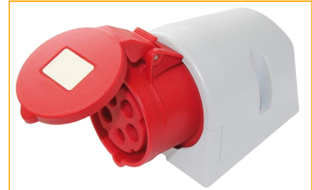
CEE 3P+N+E 6h 415-volt 16-ampere power socket.

How to use : to measure voltages on a CEE 3P+N+E 6h 415-volt 16-ampere power socket.